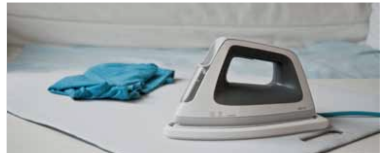
Lisa Töpfer – feinraus: ironing kit