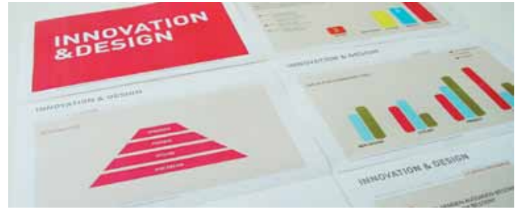
Research on role of design in Germany's 100 most innovative companies