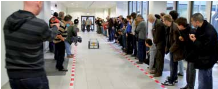
Third semester Kachelcross – innovative drive concepts for the race across the tiles. More information at http://de.youtube.com